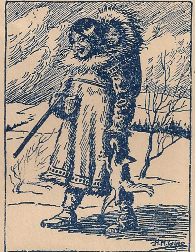
The Kobuk Maiden "Our Star Boarder."

Headquarters for Reindeer Herders. Insect Powder for Sale. Our Motto: "Do Others Before They Do You."