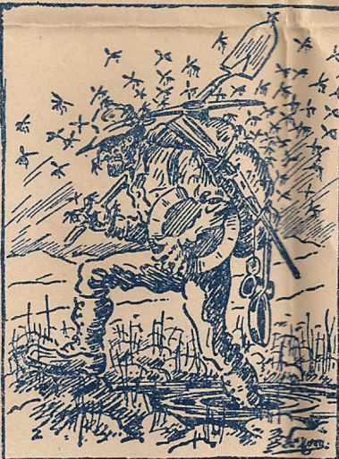
The Prospector "Stop here and you don't get stung."